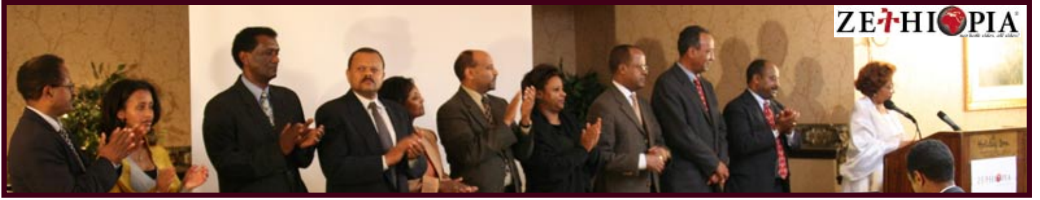
Founders and Board members of the Society of Ethiopians Established in Diaspora (SEED) at Zethiopia event

የዘኢትዮጵያ ጋዜጣ በሚያዘጋጀው ዓመታዊ የራት ምሽት በሰሜን አሜሪካ የሚገኙ በርካታ ኢትዮጵያውያንና የአገሪቱ እውቅና ብርቅ ሰዎች ይገኛሉ። በምሽቱም የህይወትና የሥራ ልምዳቸውን ያካፍላሉ። በተለያዩ የእውቀት የታሪክ የባህልና የኮሙኒኬሽን ጉዳዮችም ላይ ማብራሪያዎችን ይሰጣሉ። ሁሉም በኢትዮጵያና በኢትዮጵያውያን ጉዳዮች ላይ ያተኮሩ ናቸው። በአርአያነታቸው የላቁት ከፍ ከፍ ይደረጋሉ። በዚህ የዘኢትዮጵያ ምሽት ብዙዎች ተስተናግደዋል። ብዙዎችም እየመጡ ነው። አዝናኝና ቁምነገር በተሞላበት ዓርብ ሜይ 29/2009 በሚደረገው በዘንድሮው ዓመታዊ ዝግጅት ላይ መገኘት ለሚፈልግ ሁሉ በደስታ የተከፈተ በር አለ። ለሚያስፈልግ መረጃ 202 518 0245 መደወል ወይም www.zethiopia.com -ን ማየት ይቻላል።