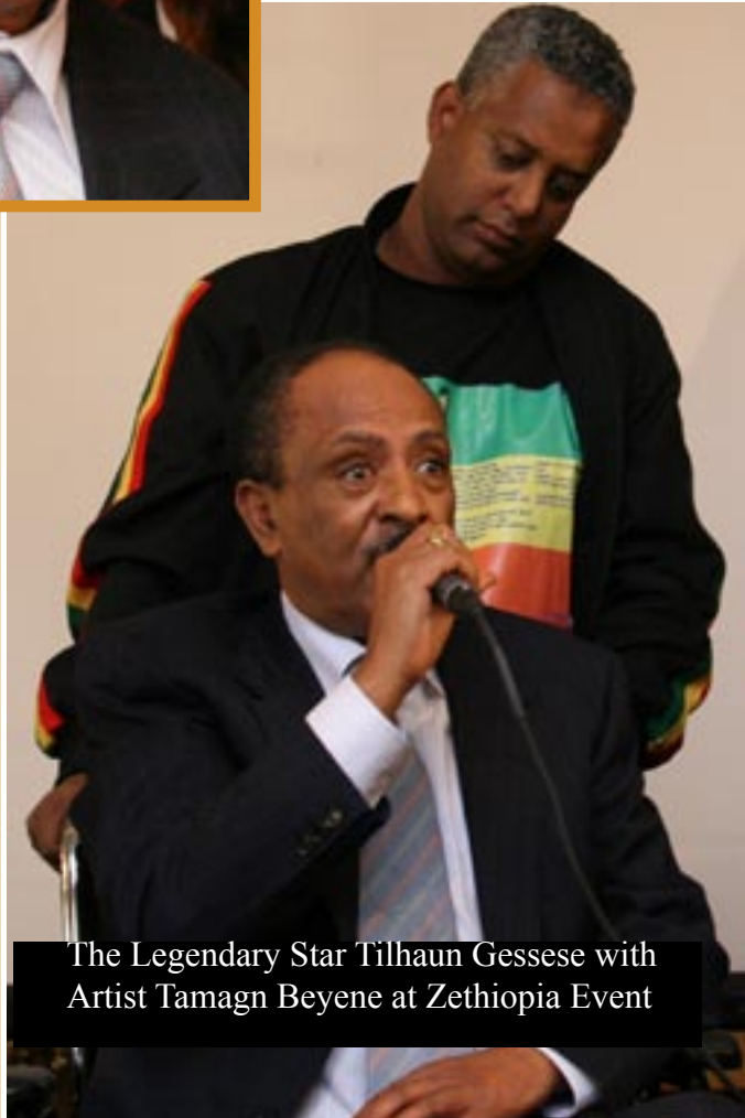
The Legendary Star Tilhaun Gessese with Artist Tamagn Beyene at Zethiopia Event