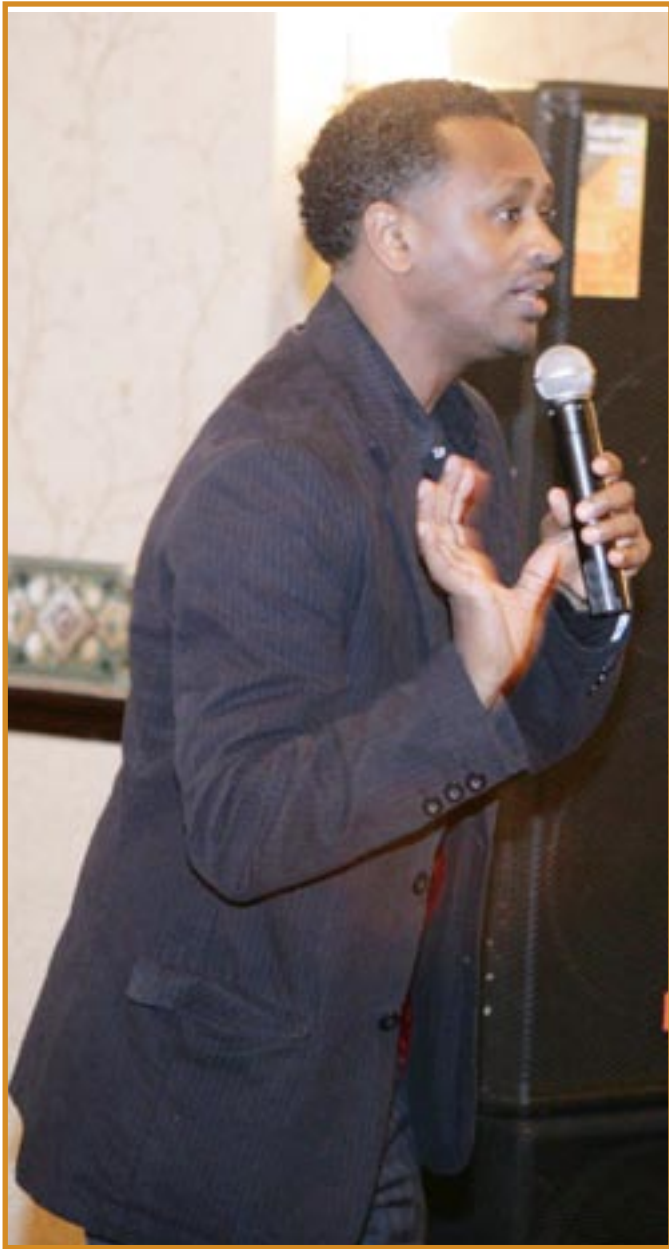
Comedian Meskerem Bekele